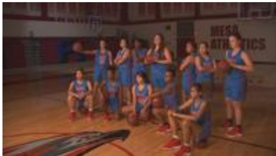
The uniforms the ladies will be wearing for that special game are part of Nike's N7 program.

->> Click/tap here to download the free azfamily mobile app .