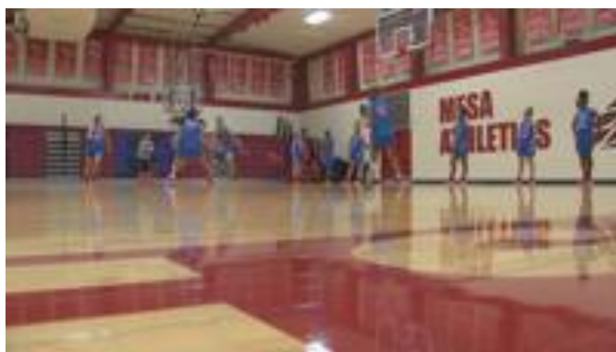
A piece of history, these teammates will remember forever and stand proud for their heritage.